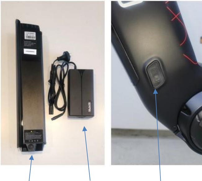
Battery charge point Charger On frame charge point

The Hybrid E Bike battery can be charged on or off the bike. The charger light when in use indicates: